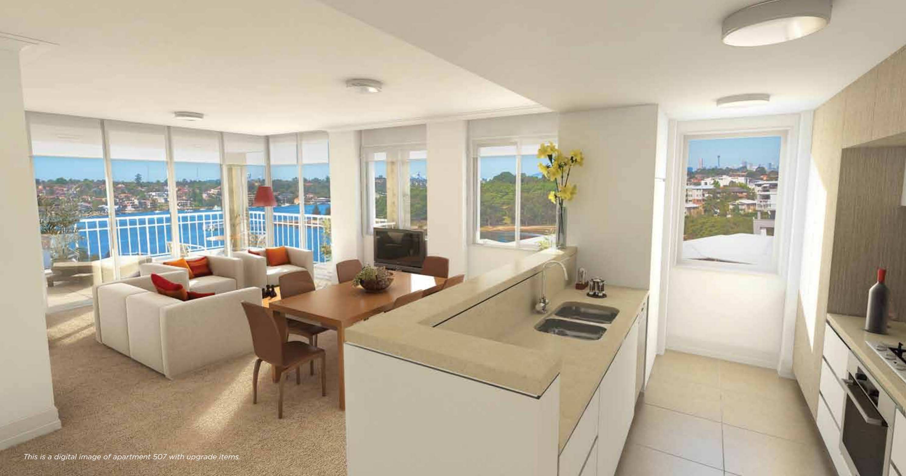
This is a digital image of apartment 507 with upgrade items.